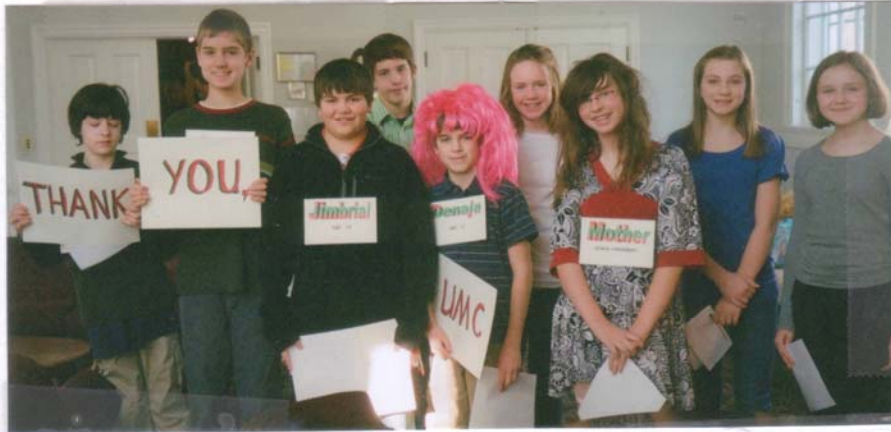
With money from the congregation the Confirmation Class bought and delivered gifts for a family in need.

... celebrate Advent & Christmas thru study and giving.